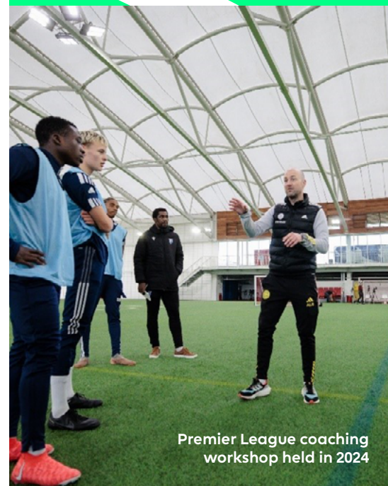
Premier League coaching workshop held in 2024

During Season 2023/24, the team set out to benchmark the environmental impact of hosting and delivering 28 coaching events across different sites. This included an analysis of travel data and hotel stays for all event attendees and the delivery of both carbon emissions and waste baselines. The team were able to identify carbon emission 'hotspots' and have since recorded a reduction in the use of petrol and diesel vehicles and an increase in rail travel and electric vehicle journeys for the people attending their events in Season 2024/25.