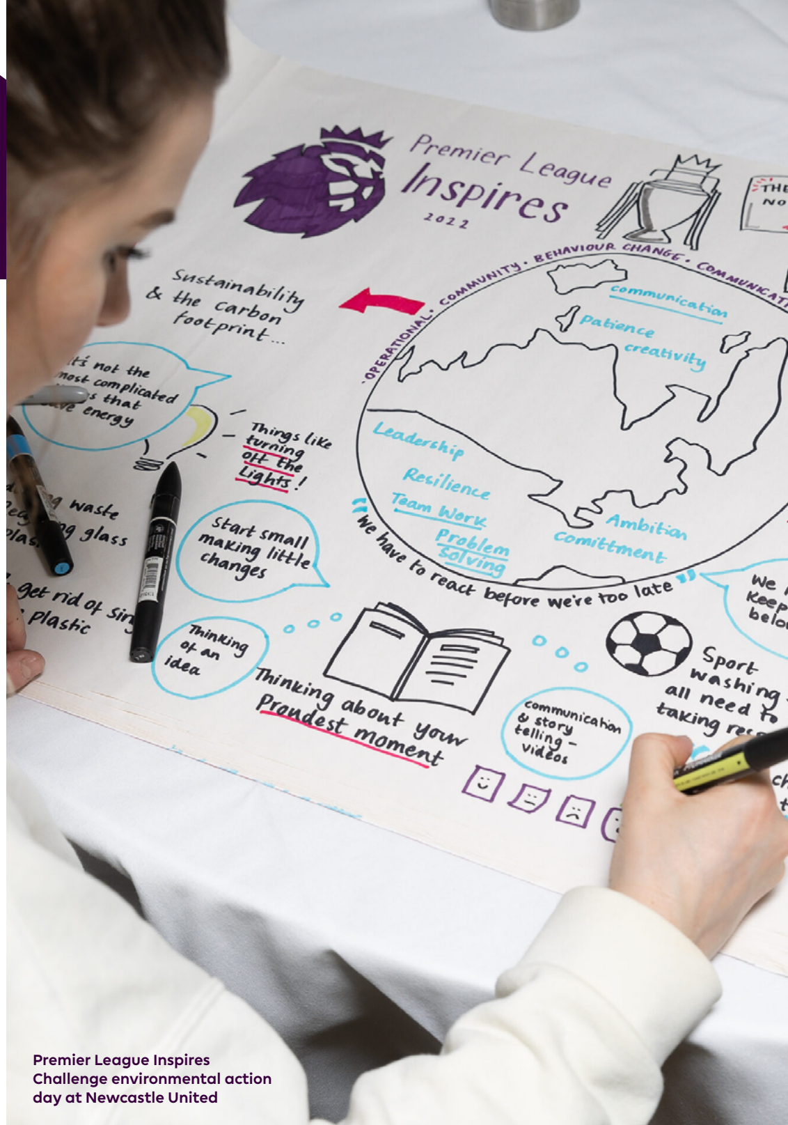
Premier League Inspires Challenge environmental action day at Newcastle United

The Capability Code of Practice (CCOP) provides rigorous governance standards that CCOs must meet in order to receive funding via the Premier League Charitable Fund and outlines recommendations for how these funds are used. In 2022, environmental sustainability was introduced as a standard within CCOP. With support from the Premier League Charitable Fund, CCOs are encouraged to formally integrate environmental actions into their governance structures and deliver engagement on environmental themes.