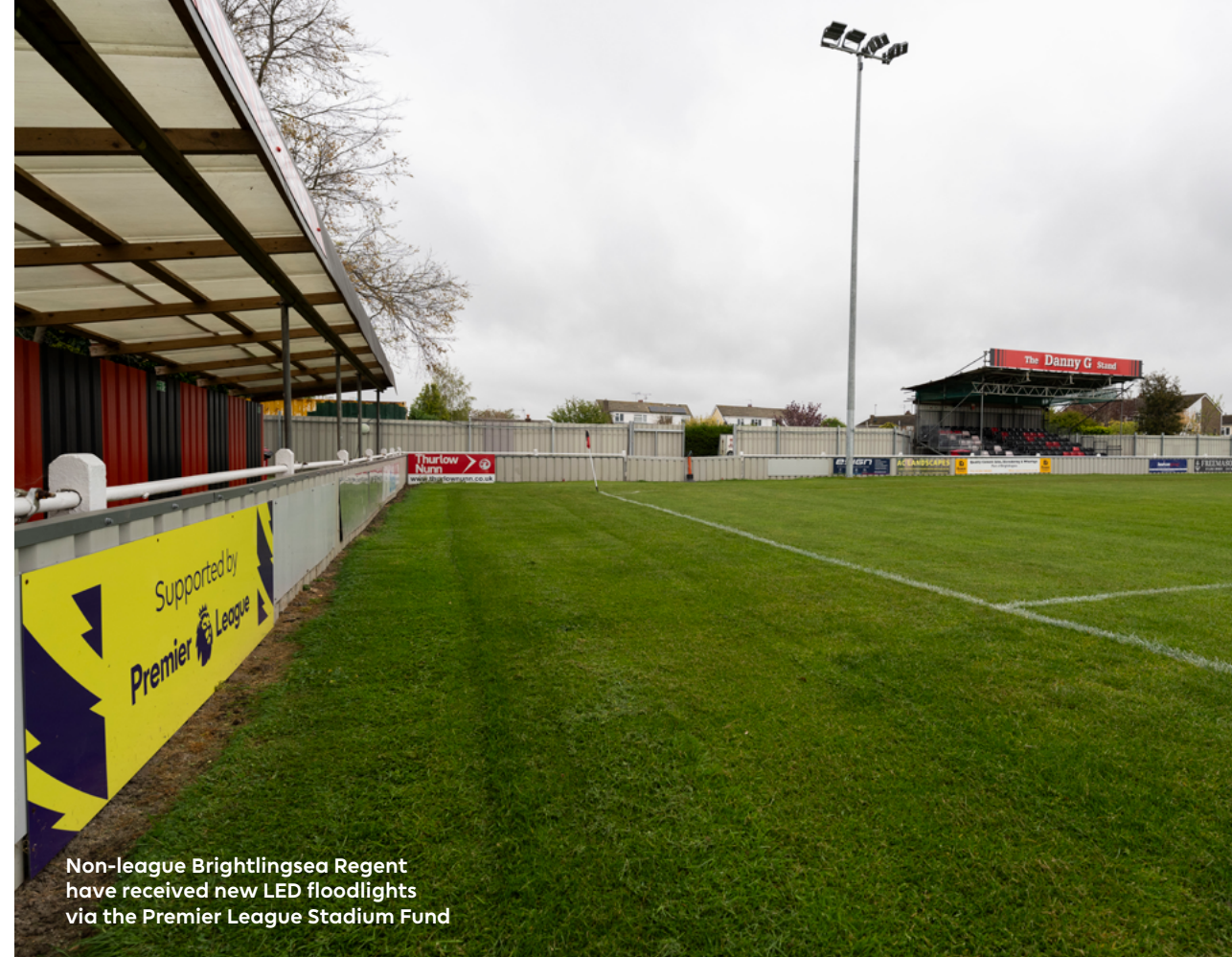
Non-league Brightlingsea Regent have received new LED floodlights via the Premier League Stadium Fund