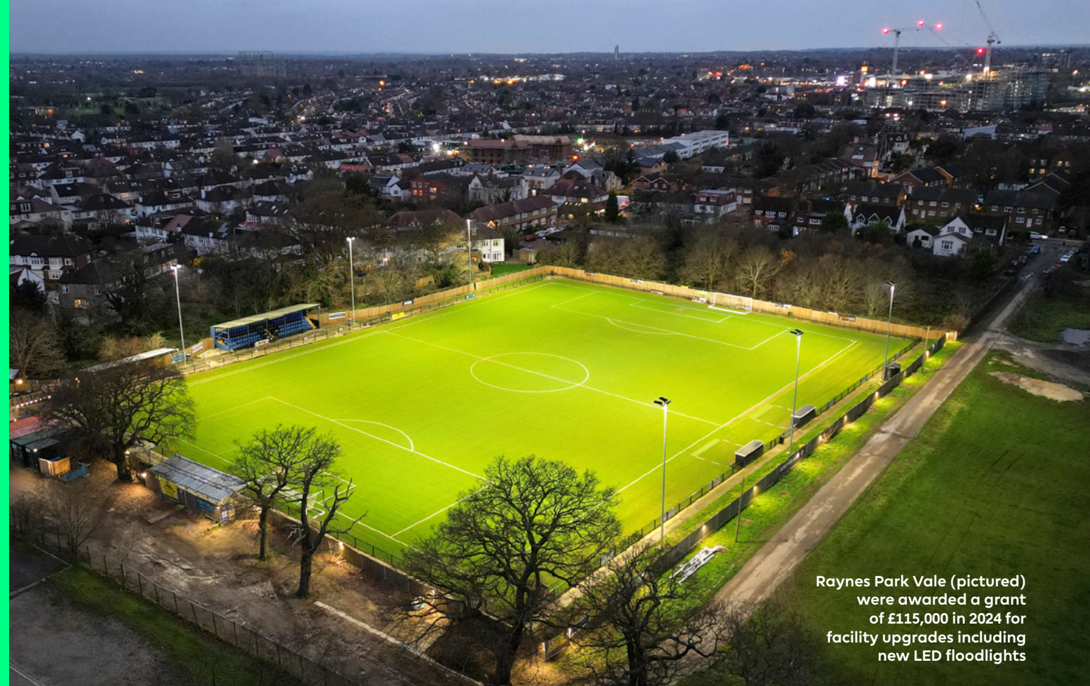
Raynes Park Vale (pictured) were awarded a grant of £115,000 in 2024 for facility upgrades including new LED floodlights

Through the PLSF's LED Floodlight Fund, the Premier League has committed £9 million to help all clubs across the National League System and Women's Football Pyramid make the 'big switch' to LED floodlights. LED floodlights typically consume 50 per cent less energy compared with older metal halide systems, meaning they last longer, cost less to run and considerably reduce carbon emissions. This helps clubs like Raynes Park Vale (pictured) to reduce both their energy consumption and their bills.