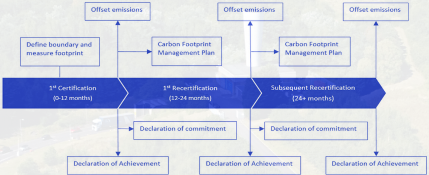
Figure 1: PAS 2060 Certification Process